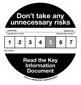
Based on the Class A EUR Acc share class.

Lipper Ratings for Total Return is supplied by Lipper, a Refinitiv Company. Copyright 2025 © Refinitiv. All rights reserved. Lipper shall not be liable for any errors or delays in the content, or for any actions taken in reliance thereto. Lipper rating based on representative shareclass.